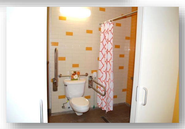
Large bathroom with shower and plenty of storage space