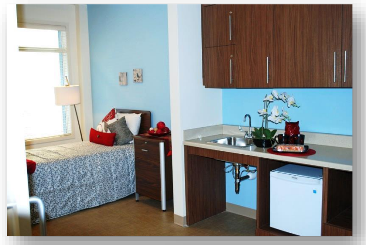
Resident Suite with kitchenette