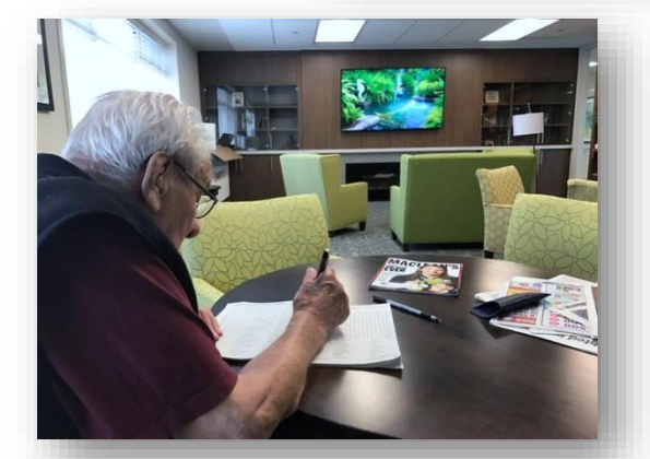
R.A. Hemstock Library