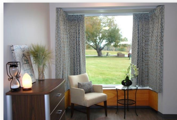
All Rooms have a large window