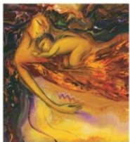
Sacredness of Life